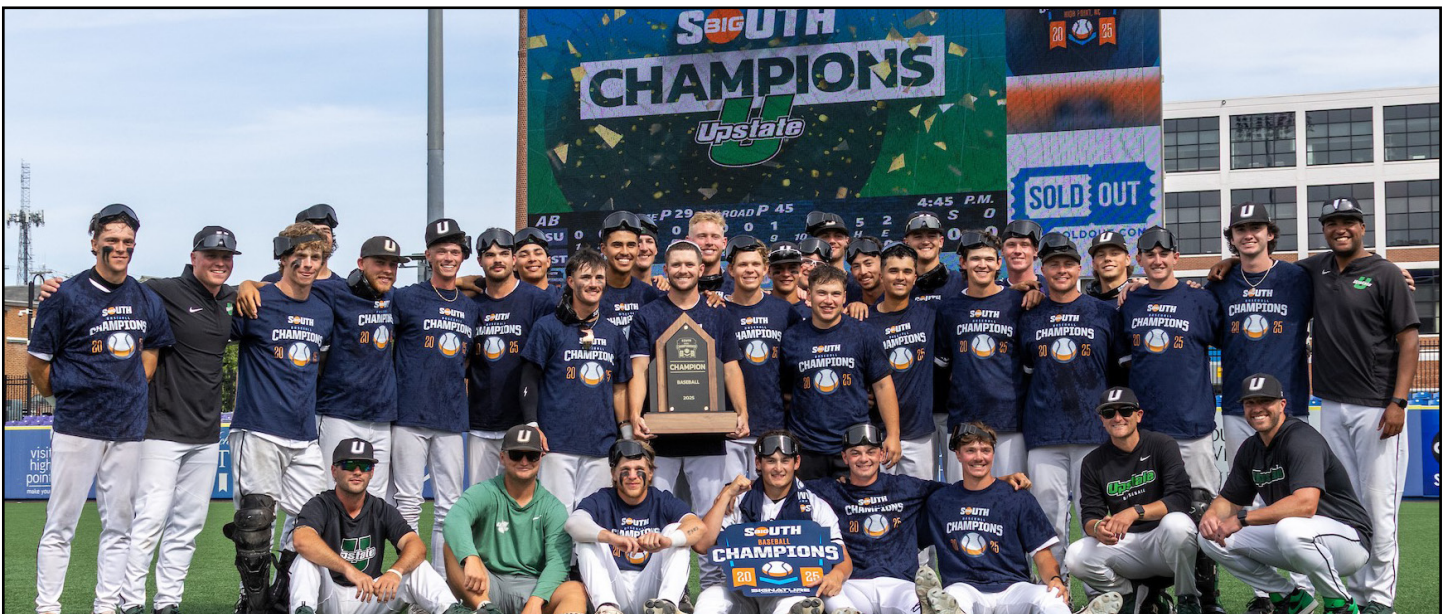
USC UPSTATE - 2025 Champions